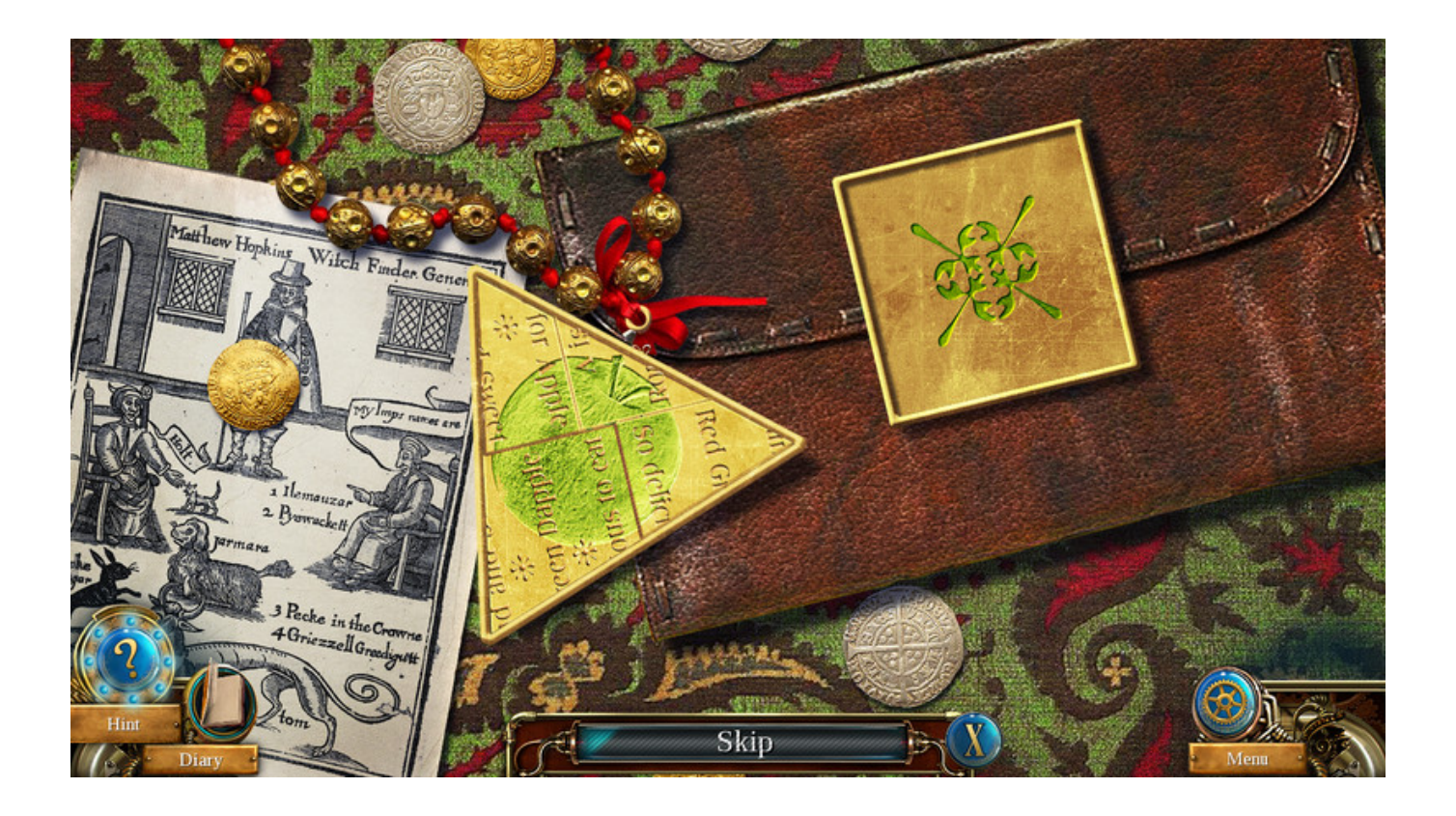
Time Mysteries: Inheritance - Remastered Download For Pc [Keygen]